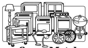
Scrap Metal Fundraiser

The East Derry Village Improvement Society is holding a scrap metal fundraiser for the Upper Village Hall project. Please support the restoration of this historic building by donating old appliances, file cabinets, broken tools, old lawn mowers – anything metal. Bring it behind the Hall (across the street from the Church) on November 7th, 8th or 9th. Limited pick-up is available; leave a message at 434-6723. No