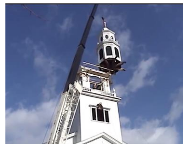
Watch the NH Preservation Alliance's video about the similar Acworth Meetinghouse steeple project at www.bit.ly/acworth-steeple