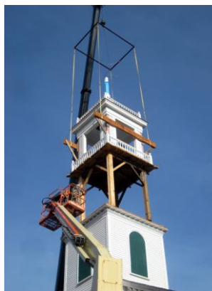
Removing the top of the Center Meeting House in Newbury, NH. Our Belfry Box has similar "legs" that telescope down into the Tower Box. These will stay with it on the ground.