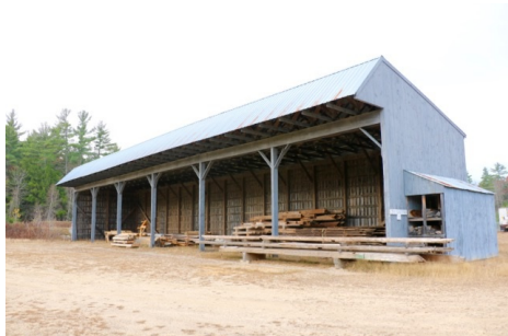
PTF's storage shed and workshop building (lower right) in Nottingham, NH where the tower top, weathervane, and bell will be stored and refurbished.

In September, our experts Arron Sturgis and Preservation Timber Framing (PTF) successfully removed the top of the Meetinghouse tower and lowered it onto the lawn. There is much upcoming work to do on the tower box (the lower section of tower still attached to the Meetinghouse) and on the tower top (currently located on staging) as well as significant work on the Meetinghouse foundation and roof. First Parish knew that there was extensive rot in some of the timbers within the tower. With the removal of the tower top, and placement of the temporary roof on the tower box, the church is more stable and better able to withstand severe weather.