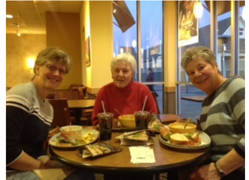
Some of our members and friends enjoying Panera Bread Dining out Event

Save the Date: Tuesday, March 8 th , 4-10 PM, our next FPC Dining for Dollars Fun and Fellowship Event will be hosted by Texas Roadhouse in Manchester. They normally only give a 10% donation for their Fundraising events, but I was able to negotiate 15% for us when I shared how successful previous events have been for us! If you haven't been to one of these yet, come on out to enjoy the fellowship!