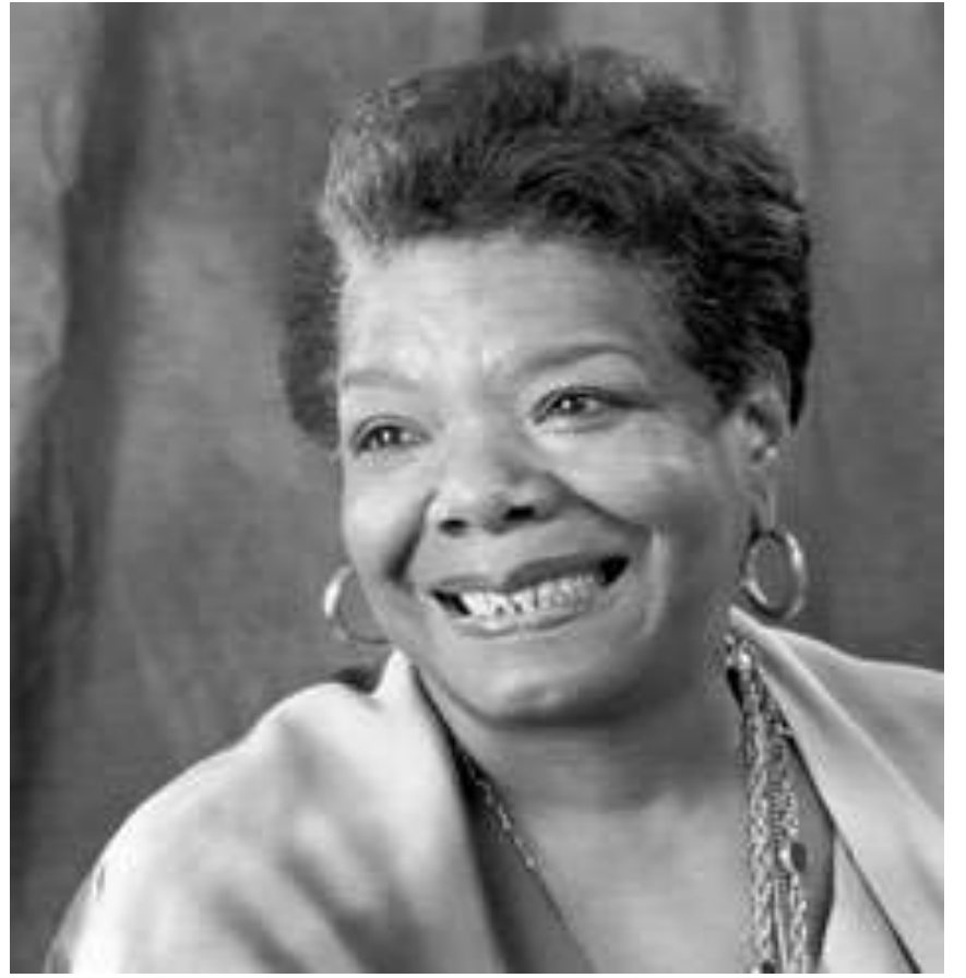
Maya Angelou April 4, 1928 – May 28, 2014

We are weaned from our timidity In the flush of love's light we dare be brave And suddenly we see that love costs all we are and will ever be. Yet it is only love which sets us free.