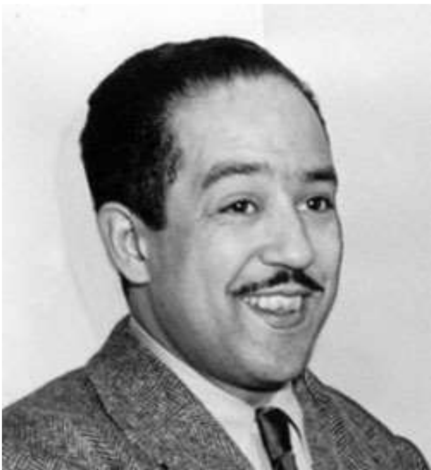
Langston Hughes February 1, 1902 – May 22, 1967