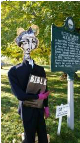
Submitted by Nancy Heywood for the Historical Preservation Committee

Our current plan is to leave the spudcrows the Historical Preservation Committee assembled up through the Sugar Plum Fair.