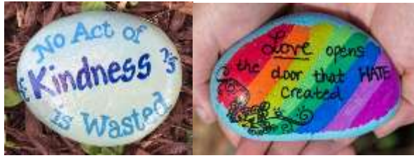
Kindness Rocks Project Painting Event