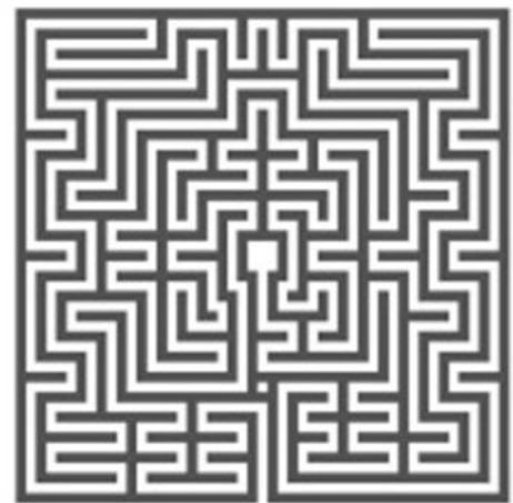
ST. OMER, NEAR BELGIUM