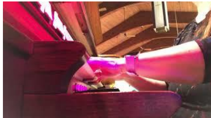
Joan Offertory Music (Nov. 8, 2020)

Enjoy these pieces we've used at recent Sunday services (click an image to play in YouTube or go to FPC-UCC Digital on YouTube to see them all).