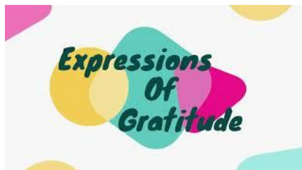
The Allen Family: Expressions of Gratitude (Nov. 22, 2020)