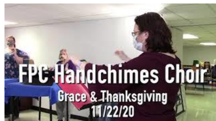
Hand Chimes Choir (Nov. 22, 2020)