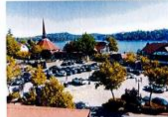
Arrowhead Village, Lake Arrowhead