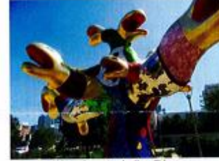
Waterfront Park, San Diego