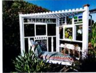
Mick's Garden Ramada