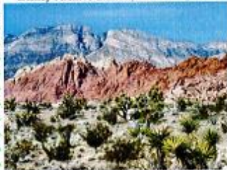
Red Rocks, Las Vegas