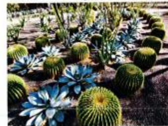
Sunnylands, Palm Springs