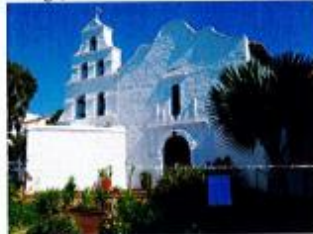
Mission Basilica San Diego de Alcalá