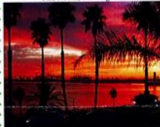
Belmont Shores, Long Beach