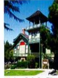
Heritage Park, San Diego