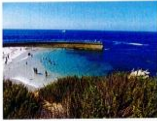
La Jolla, San Diego, CA