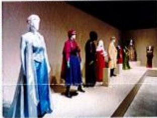
Disney Archive Exhibit, Santa Ana, CA