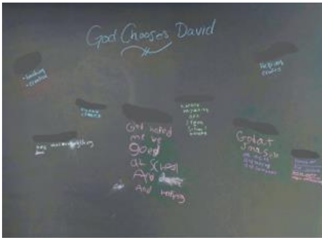
Our New Dustless Chalkboard Wall!