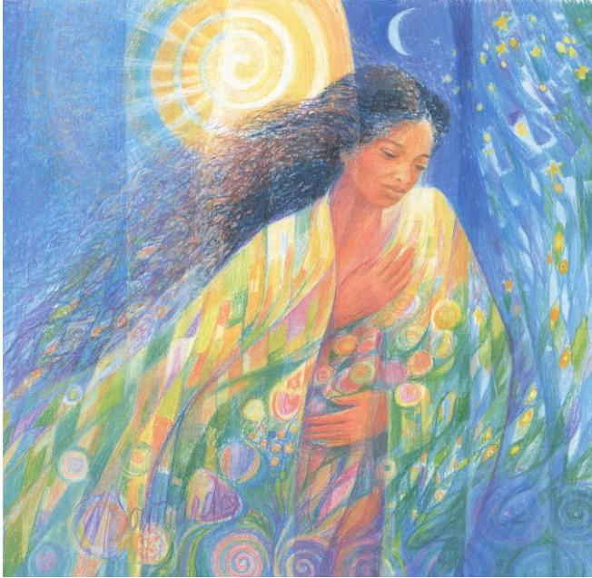
Beautiful Walk