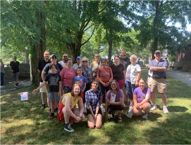
The Salem “Pilgrims” from First Parish Church