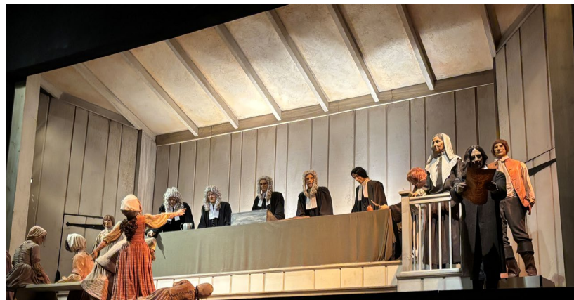
A tableau of the witch trials at the museum