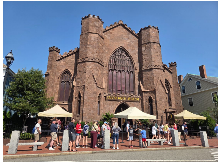
The First Parish group waits for its tour time outside The 1692 Salem Witch Museum